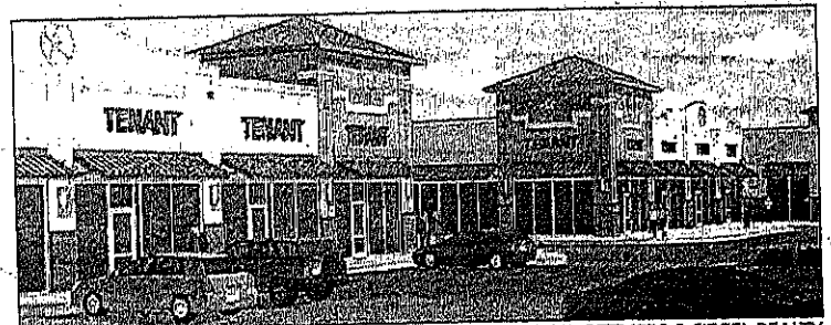
ILLUSTRATION COURTESY OF ROHDE, OTTMERS & SIEGEL REALTY

Boulder, Colo.-based Walker Enterprises has partnered with San Antonio's Rohde, Ottmers & Siegel Realty to help develop and lease the project. The two have been assembling and re-